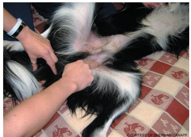
The therapist locating/palpating the iliopsoas muscle-tendon unit along the inner thigh.