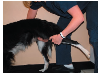
This dog is in a stretch (extension of the hip with abduction and internal rotation). If pain is evident when stretching, the dog may have a strain.

In chronic iliopsoas strains, it is important to re-initiate the inflammatory process to assist in the remodeling of the tendon fibers. NSAIDs should be avoided with chronic iliopsoas strains as they impair the inflammatory response. Rehabilitation therapy is recommended with chronic iliopsoas strains. Modalities might include heat, ultrasound, and laser, followed by massage therapy. Be sure to check movement in the sacroiliac joint (SI joint) and lumbar region (lower spine). Chronic iliopsoas strains may come from a problem with mechanics, therefore, working on correcting the mechanics of movement, will help to take the strain off the iliopsoas and contribute to its healing. If you miss correcting movement mechanics, it may not get better. The exercise progression is similar to that for acute iliopsoas strains, but initiating stretching (hip extensors with abduction) after modalities and massage is advised as are longer walks. In chronic muscle strain injuries it usually takes longer to recover and progress through the stages of healing and exercise because of the chronic nature of the changes in the myotendinous unit. Education of owners/trainers is extremely important since they should be instructed to move the dog ahead slowly. When returning to agility training, weave poles and tight