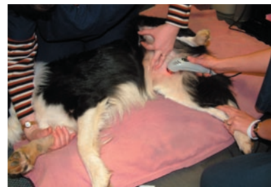
The therapist treating the iliopsoas strain with laser therapy.